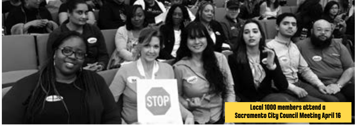
Local 1000 members attend a Sacramento City Council Meeting April 16