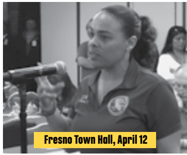
Fresno Town Hall, April 12