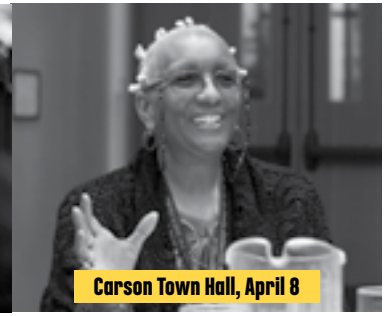
Carson Town Hall, April 8