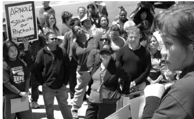
Since 2009 our members have been fighting the governor's illegal furloughs with protests such as these all over California