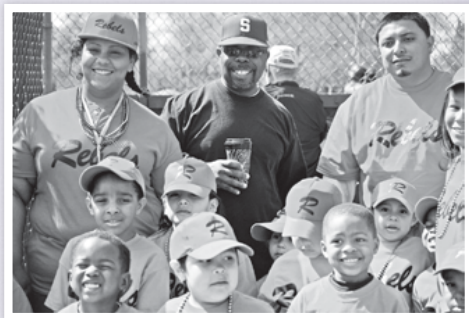
In Sacramento, dozens of volunteers renovated a Little League baseball diamond that is used by thousands of area kids.