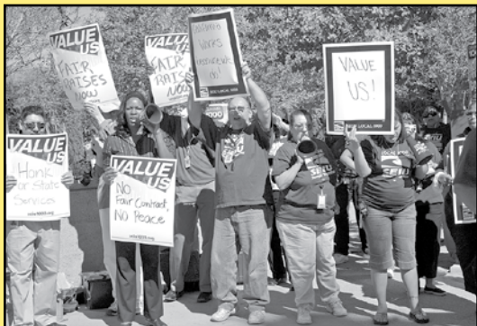
Hundreds of members from across the Inland Empire rallied for a fair contract in San Bernardino earlier this month.